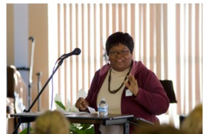
Testimonies shared after each session

To read more about what we are doing and see pictures from the conference, please visit our blog at www.aministries.com or “like” us on facebook. We rejoice over what He has done in 2011, and look forward to 2012 with great expectation!