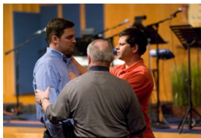
Personal Ministry - Baptism of the Holy Spirit