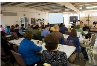
Training and Equipping Sessions

In November of this year, we held the “Transformed by Truth” conference here on the St. Giles grounds. The conference was held over two weekends and we had the privilege to train, equip & minister to approx 40 people. Below are a few pictures from the conference.